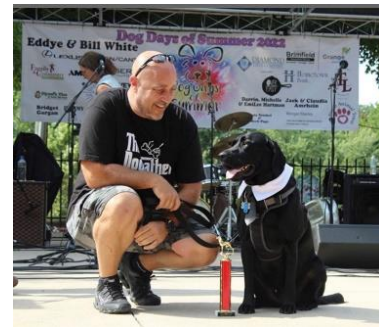
2022 WINNER - COLE FROM MEMORIAL ANIMAL HOSPITAL

We had a wonderful gathering of dogs and dog lovers for our 7 th Dog Days of Summer. This event gets bigger and better each year! Although there are many fun activities during the day, one of our favorite events is the Buddy Sessions Top Dog Contest. The contest actually starts long before the festival, with voting continuing throughout the day until 3:00 when the votes are counted. Local business and individuals are encouraged to enter their pup in the contest, and votes are collected in the form of dollars. Cash donations are accepted at the sponsoring business, and now you can even “vote” on the website. By the end of the day, the dog who has raised the most money is crowned the Buddy Sessions Top Dog, earning a handsome trophy, bragging rights, and the chance to be the Grand Marshall for the next year’s parade. Back in 2015, Buddy Sessions was the first to earn this distinctive honor. Sadly, Buddy passed away in 2017, and we renamed the contest in his honor. Please reach out to us if you would like to have a “dog in the race” this year! There are lots of opportunities to promote your candidate and your business.